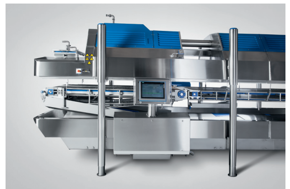
Inside the CRYOLINE®PE freezer.

BOC Australia ABN 95 000 029 729 Riverside Corporate Park 10 Julius Avenue North Ryde NSW 2113